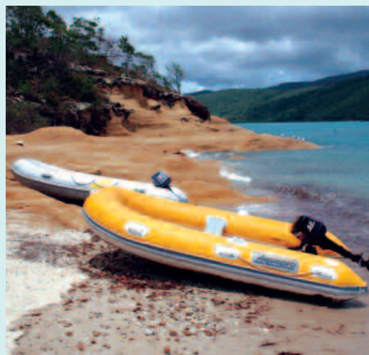
Left There are plenty of opportunities to discover your own deserted beach – the Rent a Yacht tenders were very robust and coped well with being towed through some large waves!

The Whitsundays are about 40km west of the Great Barrier Reef, just off the coast of