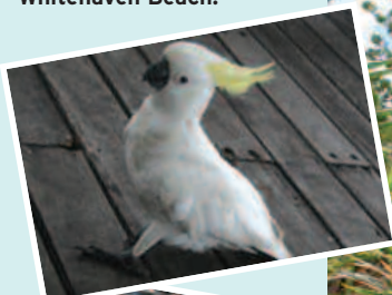
Below left to right Friendly cockatoos on Hamilton Island; the walk to Lookout Point is dotted with large iguanas; lush tropical vegetation reaches down to the waterfront; seaplanes land on Whitehaven Beach.

Deciding to settle in for the night, we gave up our mooring buoy and moved further inshore to anchor in Tongue Bay on Rent a Yacht's advice after the radio sked – advice that turned out to be well worth heeding as we watched the teenage tourers on their packed ketches and old IOR maxis swinging around their moorings. Although the sailing tours carry a surprising number of guests, we were never disturbed by noisy party boats – one of the most appealing aspects of the Whitsundays is definitely the peace and quiet.