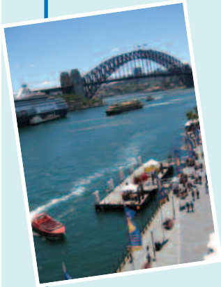
Above left to right The busy Sydney waterfront; diving the Great Barrier Reef; flying over the Reef on our way from Hamilton Is to Cairns.

Australia is a dauntingly long way away, there's no getting around it. Even for a two-week trip, it is probably too far to go purely for a charter holiday. But there are loads of ways of making the trip worthwhile, particularly for watersports fans.