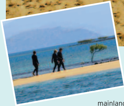
Above The sand spit at Langford Island and (inset) the infamous stinger suits.