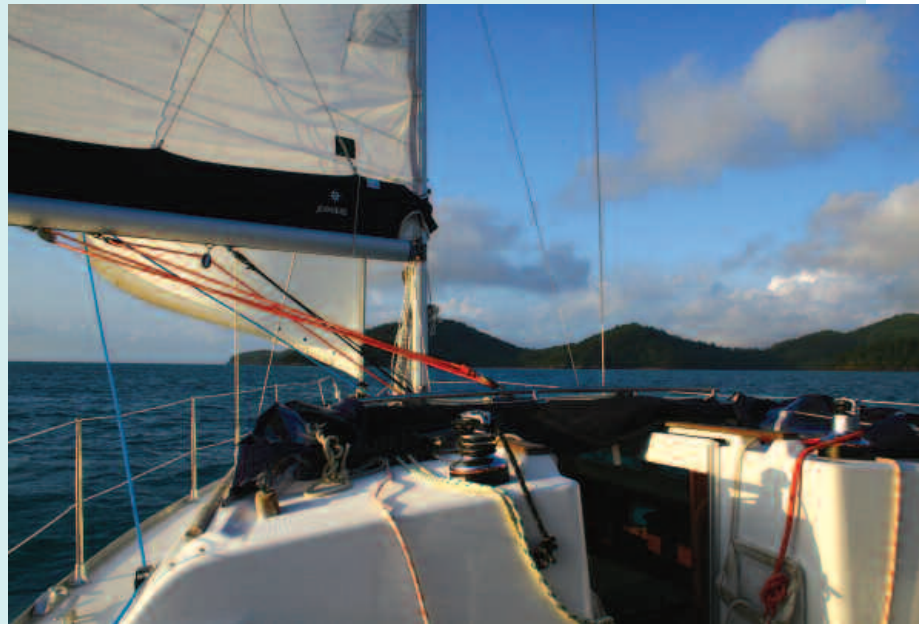
Above Early evening cruising – close to the Equator the sun sets rapidly, so boats must call in at 1600hrs each day to confirm their whereabouts.

One of the key elements of the briefing was the VHF – or more specifically the need to use it.